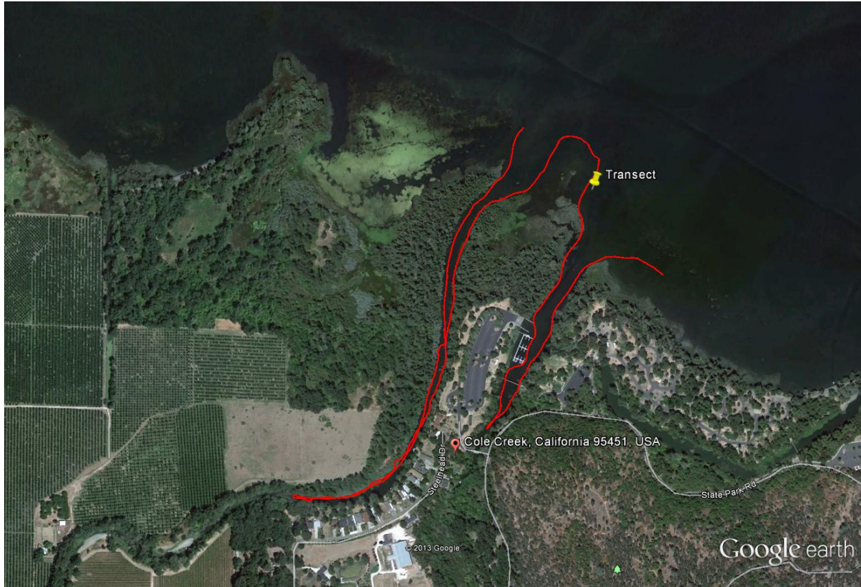
Figure 3. Map of electrofishing transect for Kelsey and Cole Creeks, including their mouth into Clear Lake (Lake County, Ca).

All hitch in the 2013 estimate were marked with a caudal punch on the upper part of the fin. This marking combination identifies a marked hitch as being part of this year's estimate.