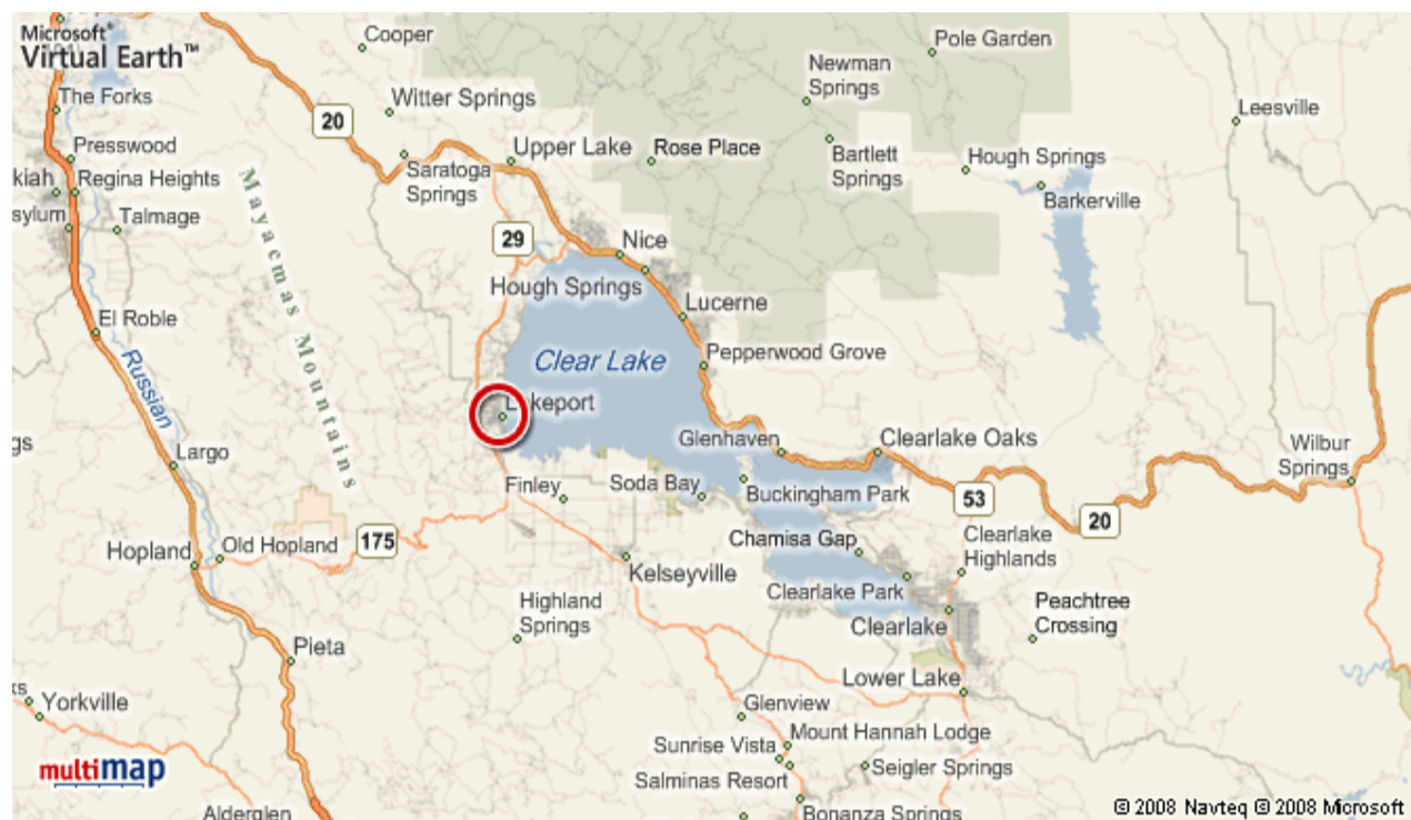
Figure 2. Map of Clear Lake in relation to Hopland.